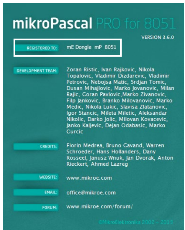
Figure 2: mikroPascal PRO for 8051 About window