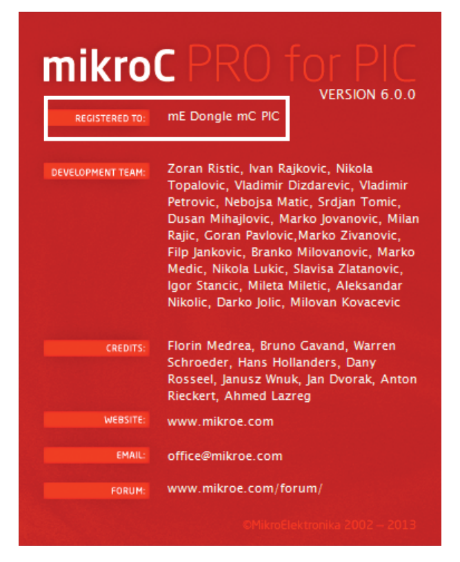
Figure 1-2: mikroC PRO for PIC® About Window