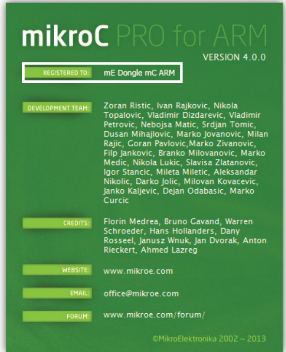
Figure 1-2: mikroC PRO for ARM® About Window