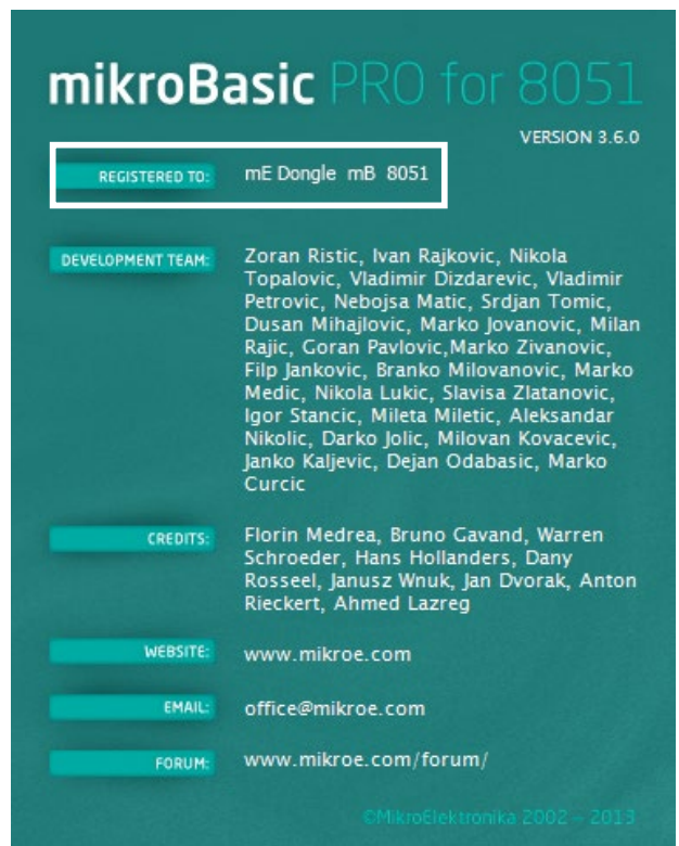
Figure 2: mikroBasic PRO for 8051 About window