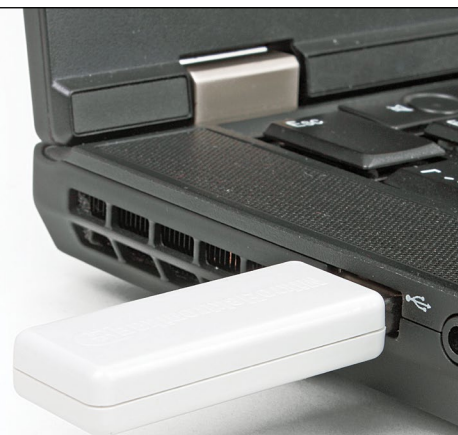
Figure 3: USB Dongle plugged into Laptop USB host connector

Unfortunately not. If you lose your dongle you will need to buy a new compiler license and pay the full price.